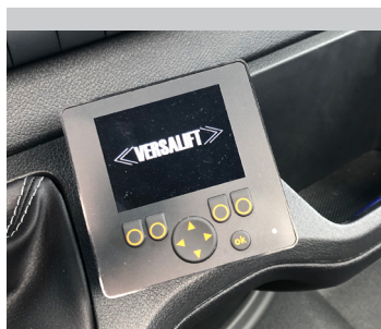
Userfriendly display in the cabin