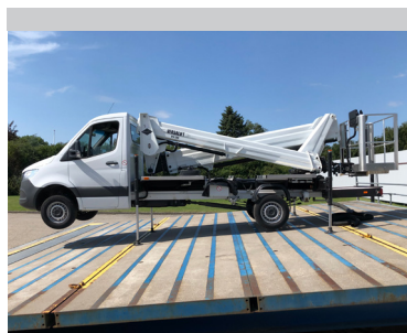
6° leveling depending on vehicle position