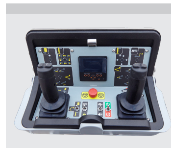
FPC (Full Proportional CANbus): Variable outreach, up to 4 simultaneous actions and home function