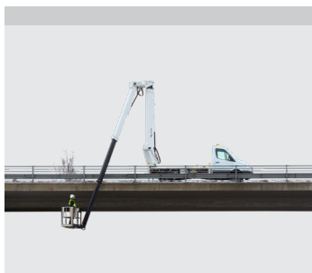
Ability to work below ground level (-3,3 meters)